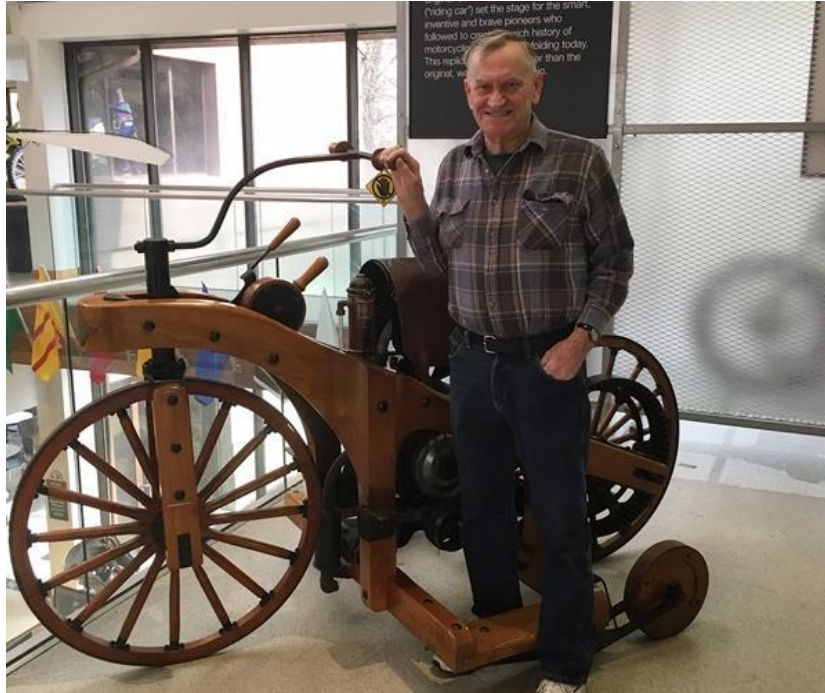
Motorcycle Museum in Pickerington, Ohio.