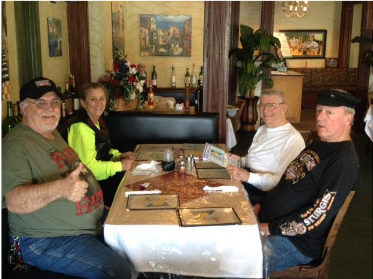
And last but not least.....The lunch Bunch