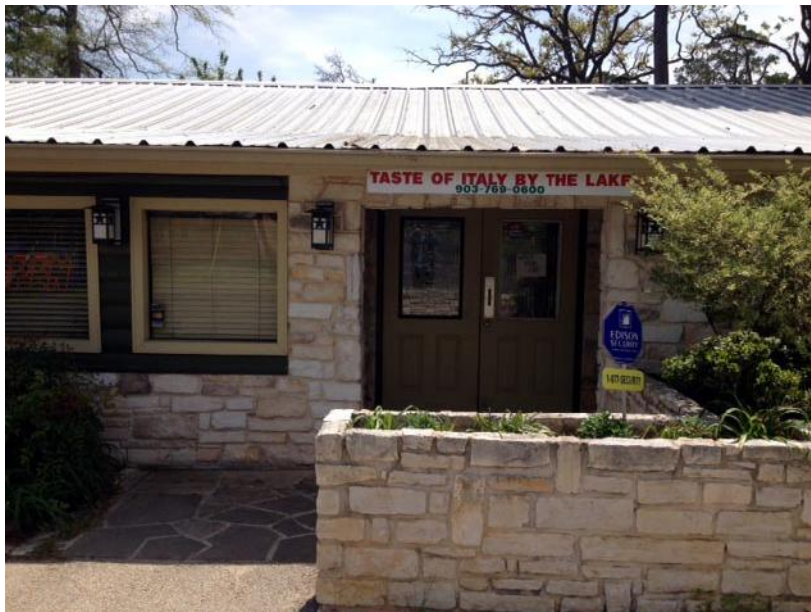
Taste of Italy Restaurant - Lake Hawkins

Terry took some photos which are shown below and on other pages.