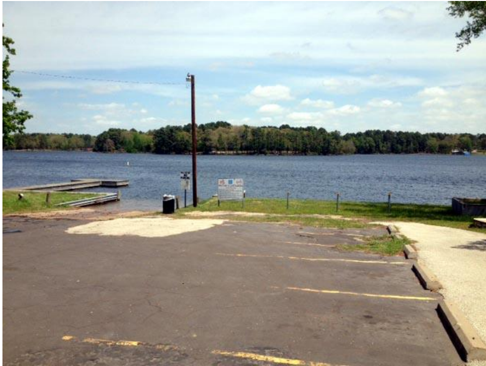
View of Lake Hawkins outside restaurant