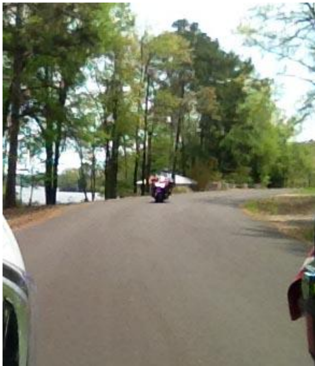
And here's R.B. bringin' up the rear again