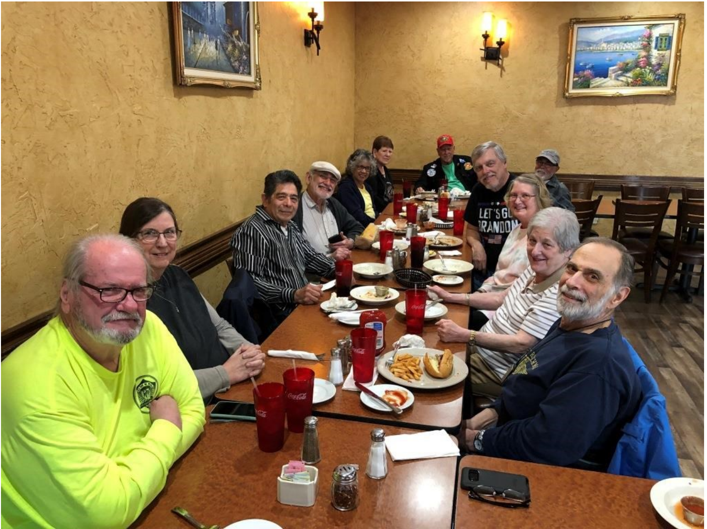
Chapter G2 enjoys dinner at Napoli's.