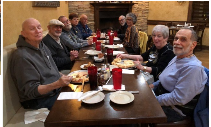
Chapter G2 enjoys dinner at Napoli's.