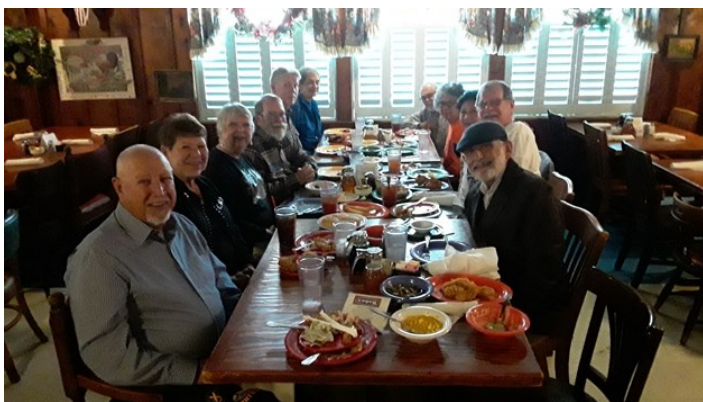
Our annual New Year's Day visit to Babe's Chicken Dinner House was a real hoot!

On the Third Tuesday of the month, folks closer to the Metroplex have an opportunity to gather together at Napoli's Restaurant in Wylie. (701 N Hwy 78, Wylie, TX 75098) - (972) 442- 4653. This is for passing information shared at the Greenville meeting and to enjoy the company of others we get to see less frequently. Gathering starts at 6:00 pm.