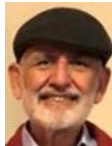
Treasurer and Newsletter Editor