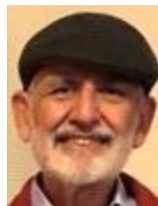
Treasurer and Newsletter Editor