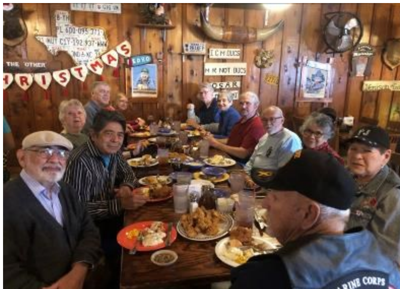
Above: Roadrunners enjoy New Year's Day at Babe's Chicken Dinner House—a Roadrunners tradition.

On the Third Tuesday of the month, folks closer to the Metroplex have an opportunity to gather together at Napoli's Restaurant in Wylie. (701 N Hwy 78, Wylie, TX 75098) - (972) 442-4653. This is for passing information shared at the Greenville meeting and to enjoy the company of others we get to see less frequently. Gathering starts at 6:00 pm.