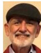
Treasurer and Newsletter Editor