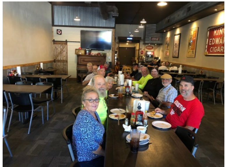
Chapter G2 enjoys lunch at The Windom Feed Sack.