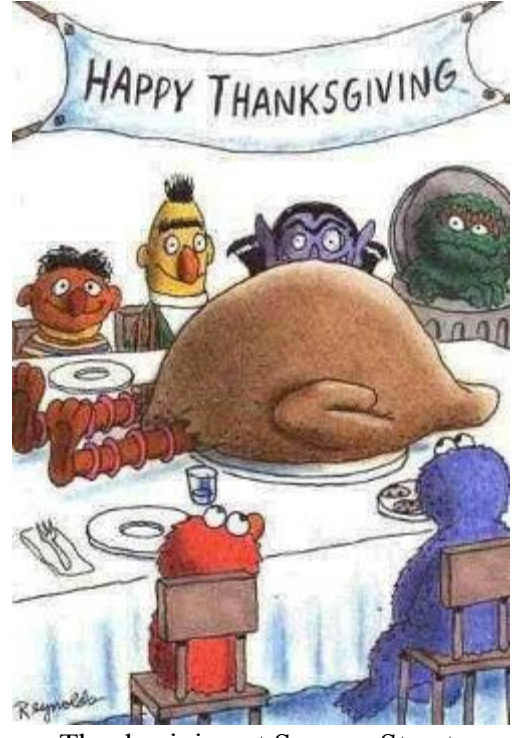
Thanksgiving at Sesame Street