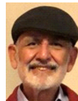
Treasurer and Newsletter Editor