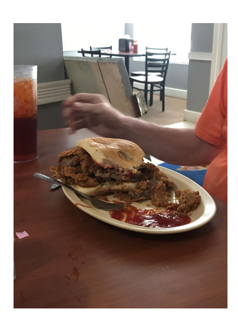
No, he didn't eat it all!

June's is on Broadway, which appeared to be a main street in town and was easy access from I-40. QP ordered the chicken fried steak sandwich and I order a patty melt. We laughed when our server brought our food, his sandwich was HUGE! Our sandwiches were delicious. I ordered French fries with my sandwich and was a little disappointed that they were the typical frozen variety, but our sandwiches more than compensated for the fries. We will certainly be stopping there again.