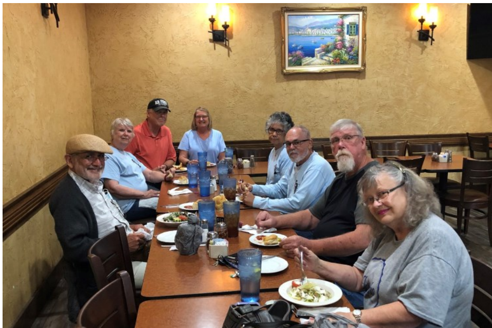
Above: Chapter G2 joins Chapter T for a brunch ride to Belton.