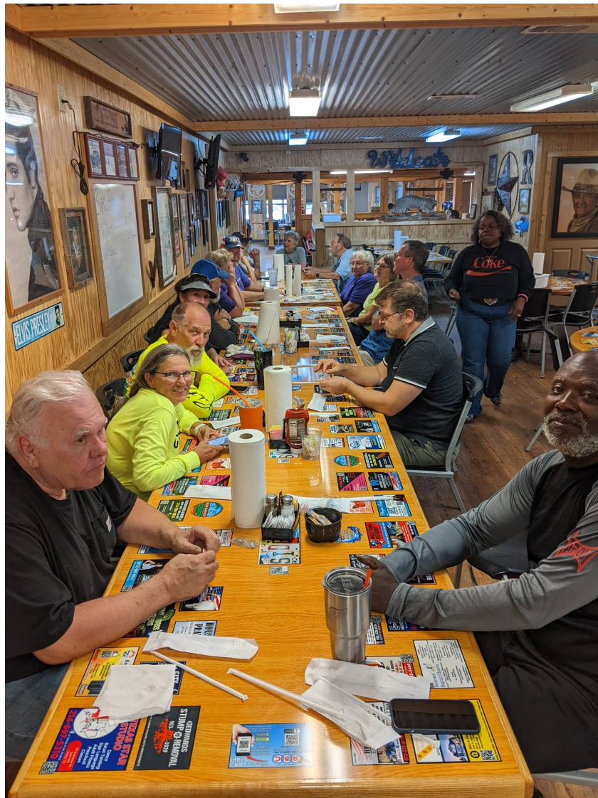
On the Chapter P Ride: Sidekick's in Emory