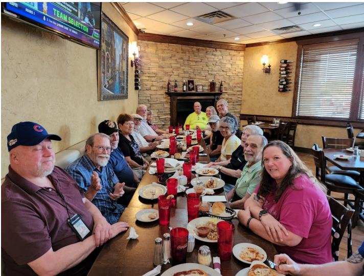
Chapter G2 enjoys dinner at Napoli's.