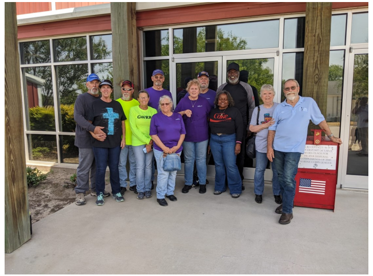
Chapter P at the Audie Murphy Museum